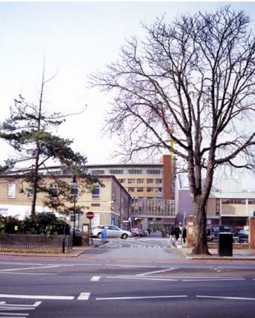
Lewisham hospital's new wing, to be ready early in 2006

The people helping to make Lewisham Hospital's new wing came to us asking for our views and ideas.